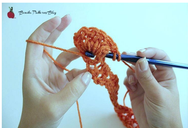
(Picture 3) Working from bottom to top around post of second dc of V-st, work 5 fpdc