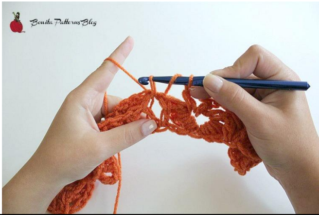
(Picture 5) Yo, insert hook in both next ch-1 space and in space between scales directly behind ch-1 sp (see pic E), and complete a V-st