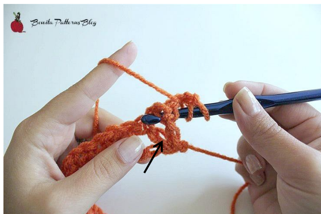
(Picture 1) Ch 3 (count as a dc), working from top to bottom around post of first dc of first V-st, work 4 fpdc (see pic A)

Note: Yarn weight and hook were changed for better visualization on photos.