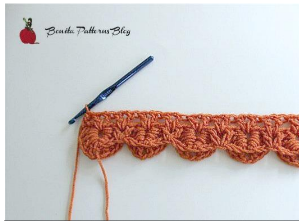
(Picture 6) Row 3 completed. This shows the wrong side of the work where all V-sts line up on top of each other.