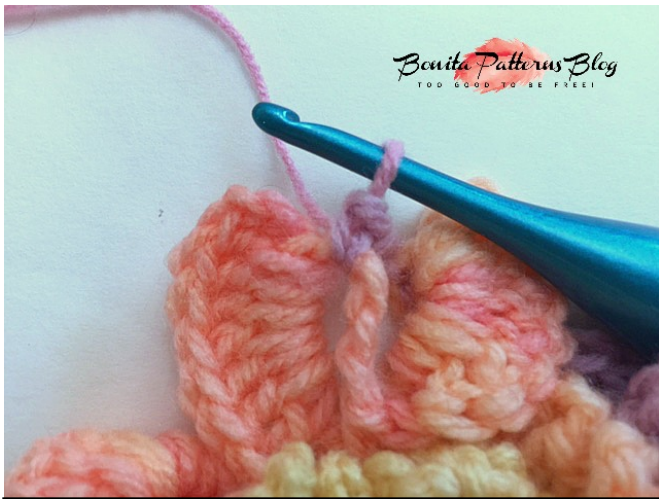
(Pic 5) - Working behind petals, ch 2, sc in next ch-4 sp of next petal