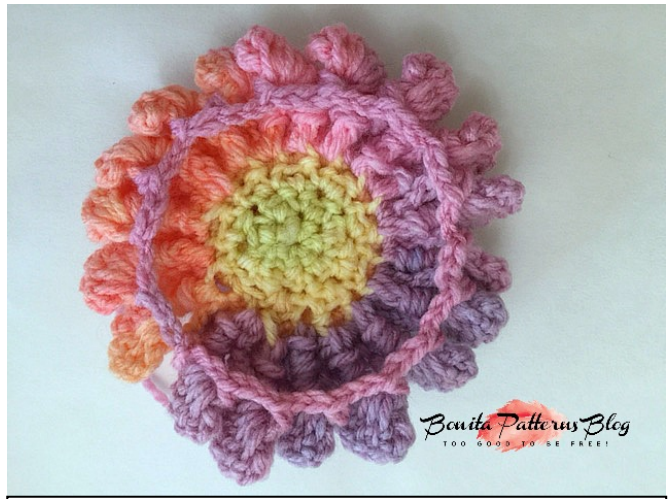
Back view after Rnd 6 is completed.